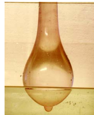
Tip Challenge with 400 ml

The Tip Challenge will stop the submerging movement and let the filled condom hang high enough for only the tip to be submerged in the electrolyte. This will allow the filled volume of water to "challenge" the tip, since most of the water filled in the condom will stretch the closed end of the condom. This will stretch the latex film of the tip and thereby facilitate detection of holes in this area.